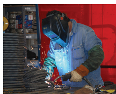
Sumter County promotes developing and maintaining a skilled and educated workforce