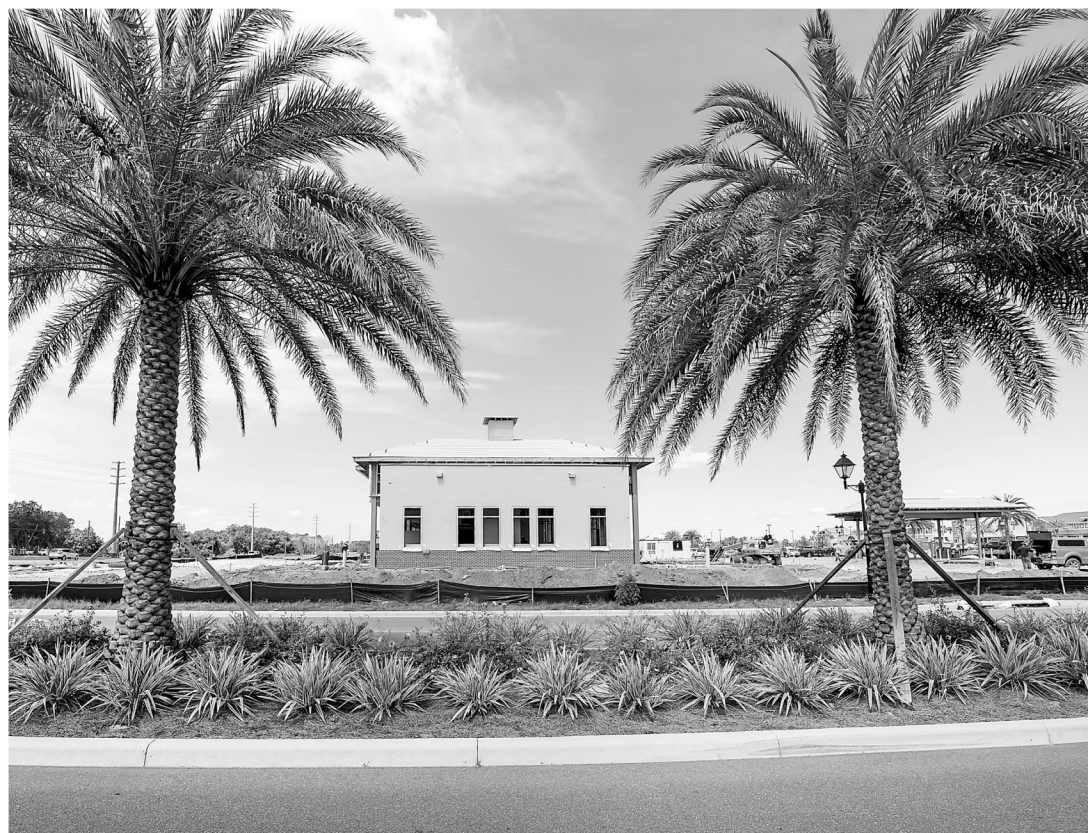
Palm trees fill the median near the new Chase Bank where construction continues Thursday at Lake Deaton Plaza.